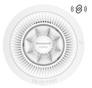
R200H-N Heat Alarm R200ST-N Smoke and Heat Alarm