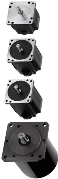
DRHX motor series