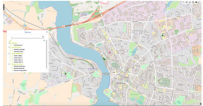
Fig. 2. Map view