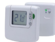
DT92E Digital Thermostat