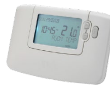
CM700 and CM900 Programmable Thermostat range (CM721; CM727 and CM921; CM927)