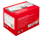
Sundial RF² Pack 3 & Pack 5