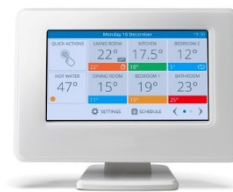
Evohome controller (ATP921R3100)